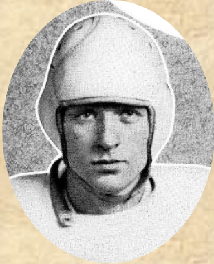
Stone (End) - '38