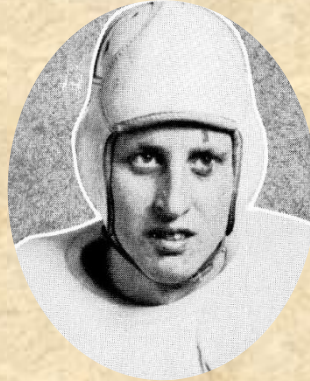
Cales (Tackle) - '37